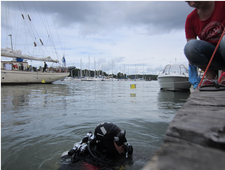
Diver in the water

This year Litter free marina – diving event took place in Nauvo guestharbour in Finland, while Floating boat show happened in Helsinki. Both events raised awareness on marine litter, especially of invisible part of litter – on the seabed.