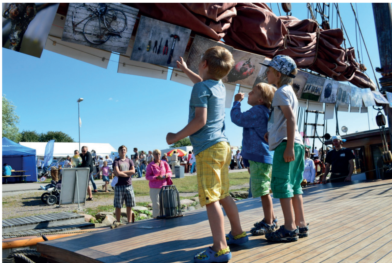
Kuressaare Maritime Festival, 2nd,3rd of August