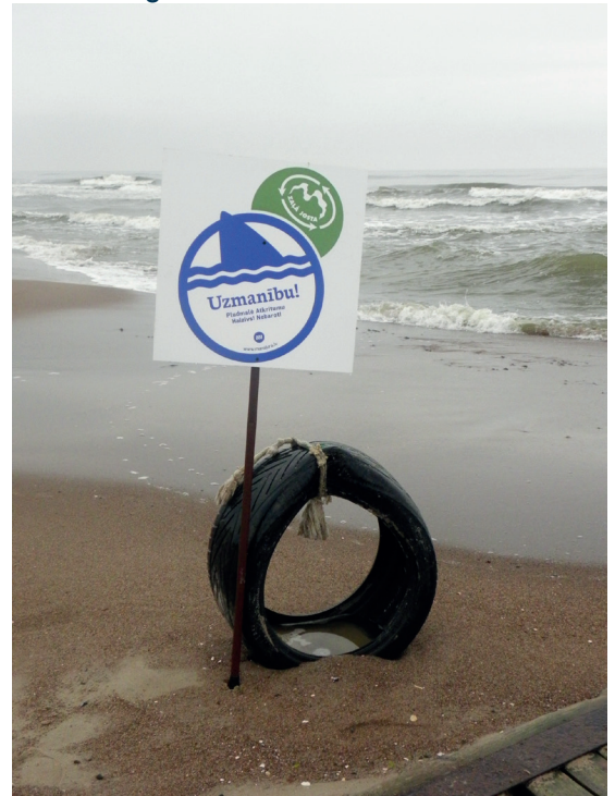
Attention! Litter Shark on the beach!