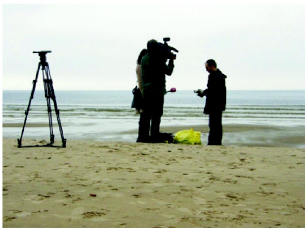
Jānis is telling local TV about project aims and first findings during the monitoring.

„Baltic marine litter project MARLIN`s one of the main activities – litter monitoring – for the first time was launched this spring to collect data from each partner organization around the Baltic Sea,„