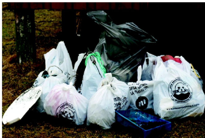
Litter in Björkö.

The remaining two will be done in the beginning of May in Kotka. All-together over 1200 pieces of litter have been found so far. Most of the litter found was plastic - fragmented or still in one piece such as plastic bottles.