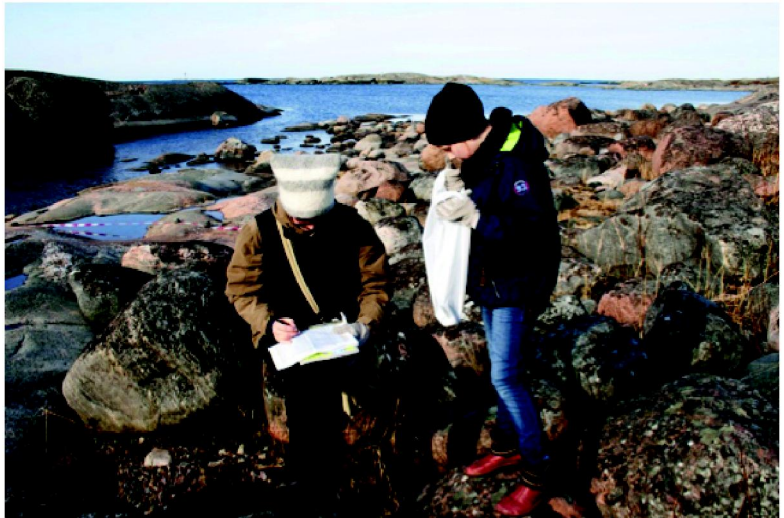
„Litter assesment in process in Utö.

In Estonia first monitoring was located on Saka beach, which is on Northern East of country, with 44 kg total litter amount, which was „quite expected”, regarding to the words of project leader Marek Press. No cigarettes, butts or filters were found on first surface. It was big event with 50 person involvement.