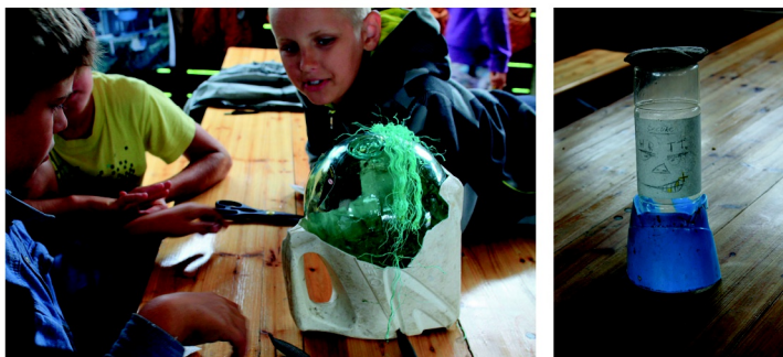
Beach litter art work in Paldiski

Litter contest in Estonia activated people in different parts of Estonia, mostly children. They did beach clean ups together with Keep Estonian Sea tidy and also made art work using beach litter in connection with clean ups. The best works will be evaluated in the middle of September.