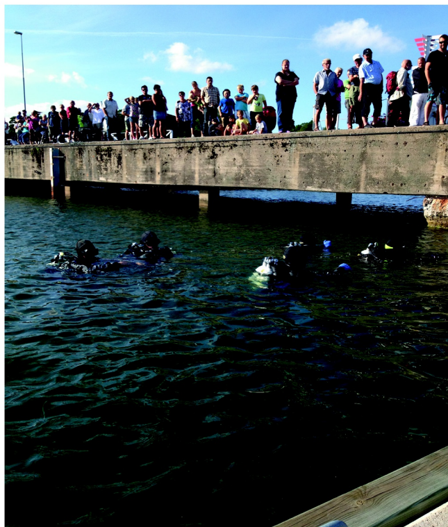
Diving into the sea bed for litter

This summer Keep Sweden Tidy together with local diving clubs collected litter on the sea-bed in the Norrtälje and Oxelösund Blue Flag marinas. The litter has been brought up to the surface and arranged with a litter competition between the different diving teams. The different items have been found, mostly carts, bicycles, tires, glass bottles and cans, different tools, ladders, plastics, batteries, chairs and umbrellas. However non-typical things like an iron, old typing machine, pieces from a motorcycle, canned vegetables, old coffee pot were also in the list.