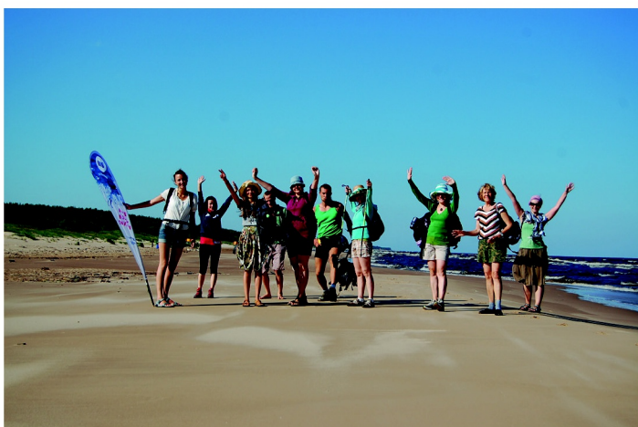
Hiking team on their way

This summer from 28th of June – 28th of July FEE Latvia launched the campaign “My Baltic Sea” and invited people to join in a 30 days long hiking trip around the Baltic Sea shore in Latvia to find out litter situation of the beaches by doing marine litter monitoring. 35 beaches were monitored in total and more than 40 people joined the campaign.