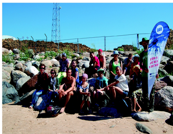
After litter monitoring at Zvejniekciems