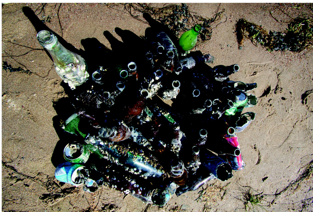
Straightly from sea bed

In co-operation with Nauvo guestharbour and a local diving company Ursuk, KAT (Keep the Archipelago Tidy Association) organized a diving event in Nauvo. During two hours, five divers worked underwater and lifted up several recognizable items, including a grill, clothes, a shoe, a pile of cans and glass bottles, pieces of pier, ropes and toys. Items were used to create an installation.