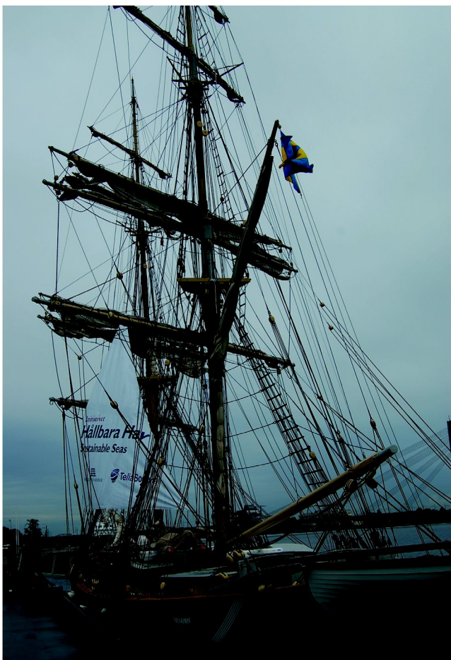
Briggen Tre Kronor in Riga

On September 13th MARLIN 2nd International Conference was held in Riga, at Briggen Tre Kronor in port of Riga. Different initiatives for cleaner Baltic