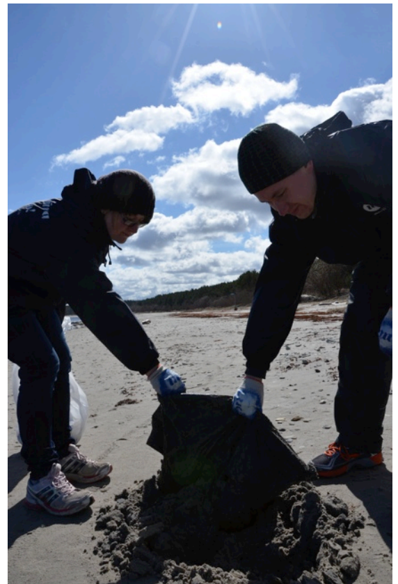
Pictures from beach litter assessments in Latvia this year.