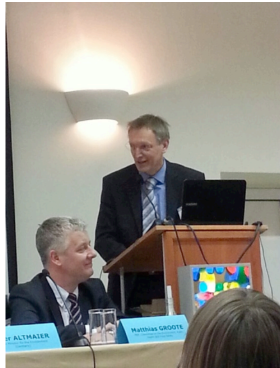
European Commissioner Janez Potocnik, speaking about marine litter at the conference in Berlin

The International Conference on Prevention and Management of Marine Litter in European Seas was held in Berlin, Germany, 10 – 12 April 2013. The Conference participants, which included a wide array of stakeholders, government representatives, businesses and regional organisations, analysed the issues at stake, reviewed current efforts and suggested ways forward in order to address marine litter. Results and aims of project Marlin was presented to the audience and got full attention of participants and special interest from HELCOM.